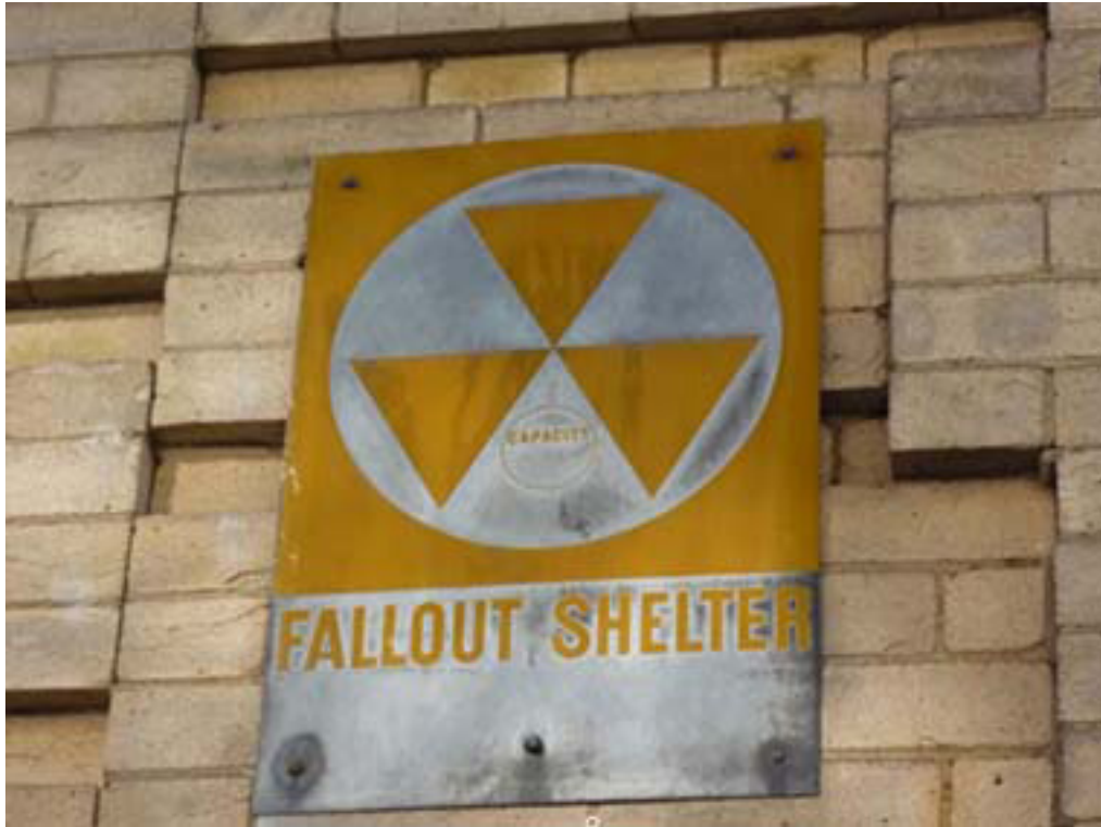
Fallout Shelter Sign, 1961. Photographed 2016.

A DANGER UNLIKE ANY DANGER: Nuclear Disarmament Campaigns 1957-1985